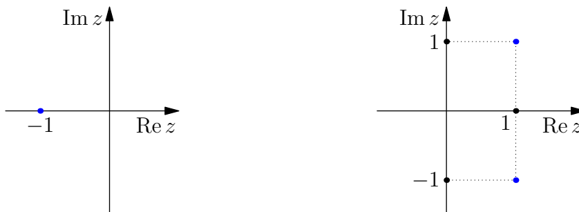
FIGURE 1. The singular points of the equations (7) and (11).

The function q(z) is finite for all z \in \mathbb{C} except at z = 1 \pm i , and we have |q(z)| \rightarrow \infty as z \rightarrow 1 \pm i . Therefore we conclude that the only singular points of the equation (11) are at z = 1 \pm i , and all other points in the complex plane are ordinary points.